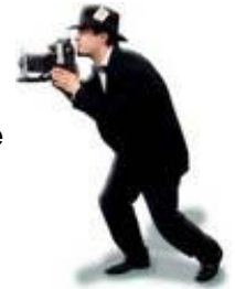
Photo sessions are scheduled for March 30th –April 4th at the studio . Please make sure you check the photo schedule listed on the photo envelope to be received at open house to find your dancer's photo time. There is no need to make up these classes, as your photo time is considered your class time. Please do not wear costumes to the studio . All costumes should be brought to the studio in some type of protective plastic, or garment bag.

Please make sure all costumes, tights, headpieces, props, and shoes are labeled with your dancer's name or initials prior to your photo date. If you have purchased new ballet slippers that need to be sewn, please have that done for photos. Even if you do not plan to purchase individual photos, please plan to attend class photo times in order to be in the group picture. (Group photos will be available for purchase and will be printed in the Keepsake Program.) Moms, you must stay to dress dancers for photos; do not drop them off alone during photo week.