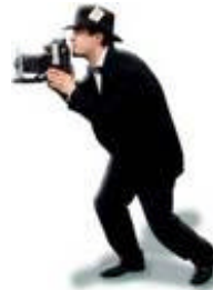
Photo sessions are scheduled for April 12 –April 17th at the studio . Please make sure you check the photo schedule, listed on the photo envelope (to be received at open house), to find your dancer's photo time. There is no need to make up these classes, as your photo time is considered your class time. Please do not wear costumes to the studio . All costumes should be brought to the studio in some type of protective plastic or garment bag.

Please make sure all costumes, tights, headpieces, props, and shoes are labeled with your dancer's name or initials prior to your photo date. If you have purchased new ballet slippers that need to be sewn, please have that done for photos. Even if you do not plan to purchase individual photos, please plan to attend class photo times in order to be in the group picture. ( Group photos will be available for purchase and will be printed in the Keepsake Program.) Moms, you must stay to dress dancers for photos; do not drop them off alone during photo week.